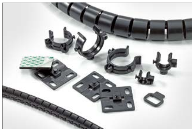
The Helawrap accessory set for bundling, protecting, mounting and routing cables.