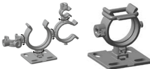
Multiple clips can be joined. Clips swivel freely.